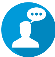
Everyday Performance Conversations

The brain-based strategies used to hold quality conversations involve tuning into the social drivers of human behavior, evoking a mindset of growth, and promoting solution seeking through insight. The types of conversation we employ these strategies in include: