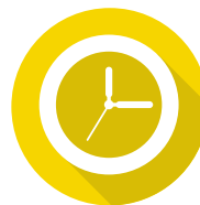
Annual Performance Conversations