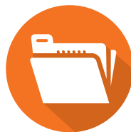
Project-Based Performance Conversations