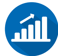
Longer-Term Career Conversations